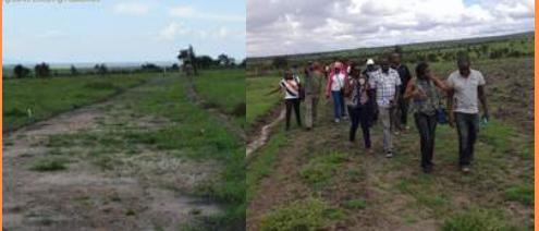
(iii) Naserian Gardens gated neighbourhood-Isinya