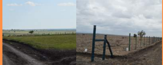
(iv) Kitengela gated neighbourhood