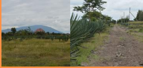
(i) McMillan Valley gated neighbourhood-Juja