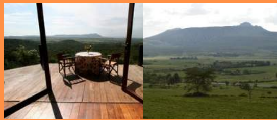
(ii) Naivasha phase 4 gated neighbourhood