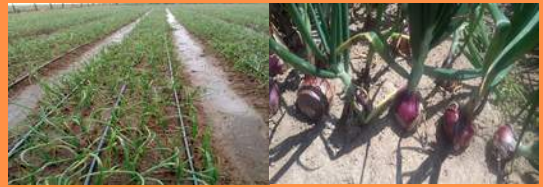
(vi) b. Narok gated farmlands