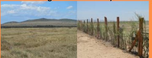
(v) a. Narok gated neighbourhood